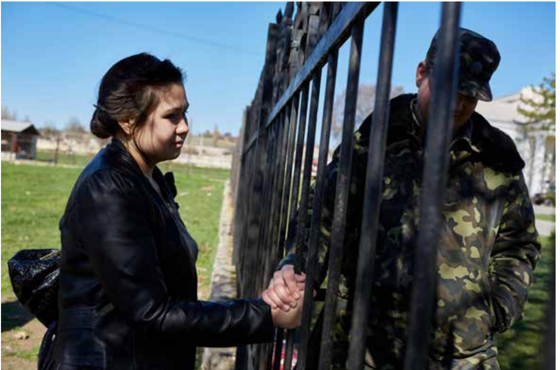
Lubimovka, March 05, 2014 - A Ukrainian officer holds hands with his wife through the fence of a military base.