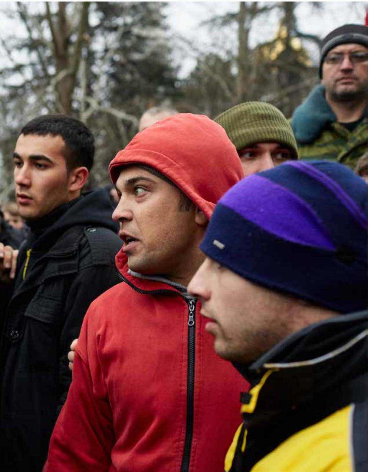
Simferopol, February 26, 2014 - Clashes erupt outside the Regional Parliament between pro-Russian separatists and pro-Kiev protesters.