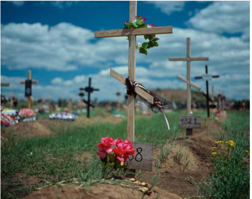
Donetsk, May 17, 2015 - Nameless graves are marked with numbers in a pro-Russian military graveyard.