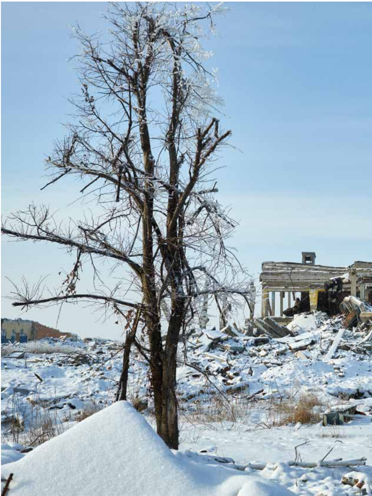
Luhansk, January 02, 2016 - The remains of Ukrainian soldiers still rest under the rubble of Luhansk's airport.