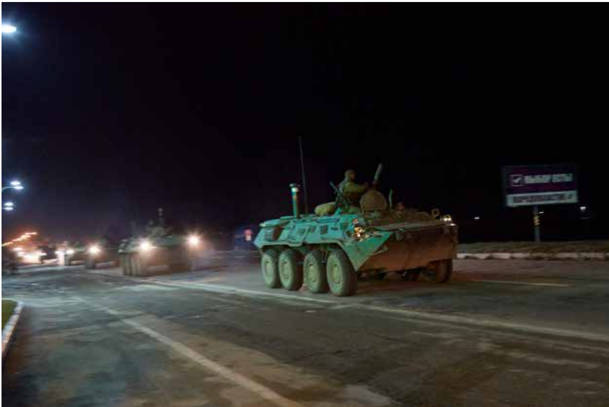
Simferopol, February 28, 2014 - A Russian military column drives by a referendum campaign poster.