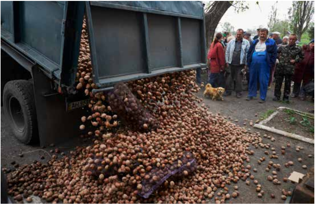
Nikishyne, May 5, 2015 - Residents receive potatoes from the authorities of the self-proclaimed Donetsk People's Republic.