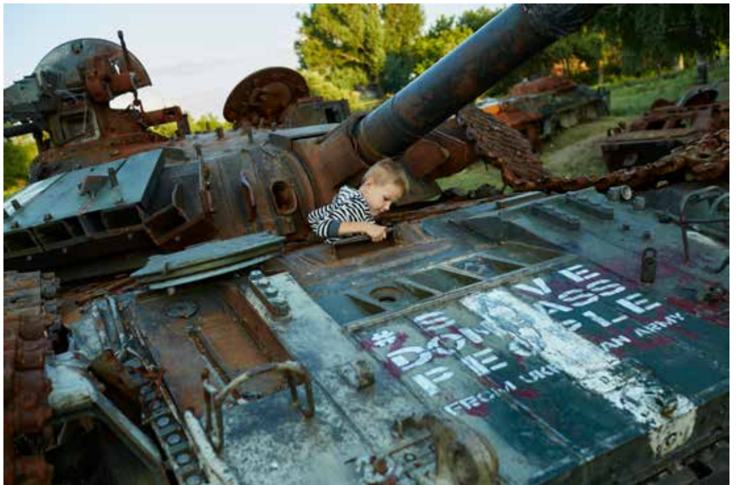
Luhansk, July 11, 2015 - A child plays in a destroyed Ukrainian tank tagged with a propaganda slogan by Russian-backed separatists.