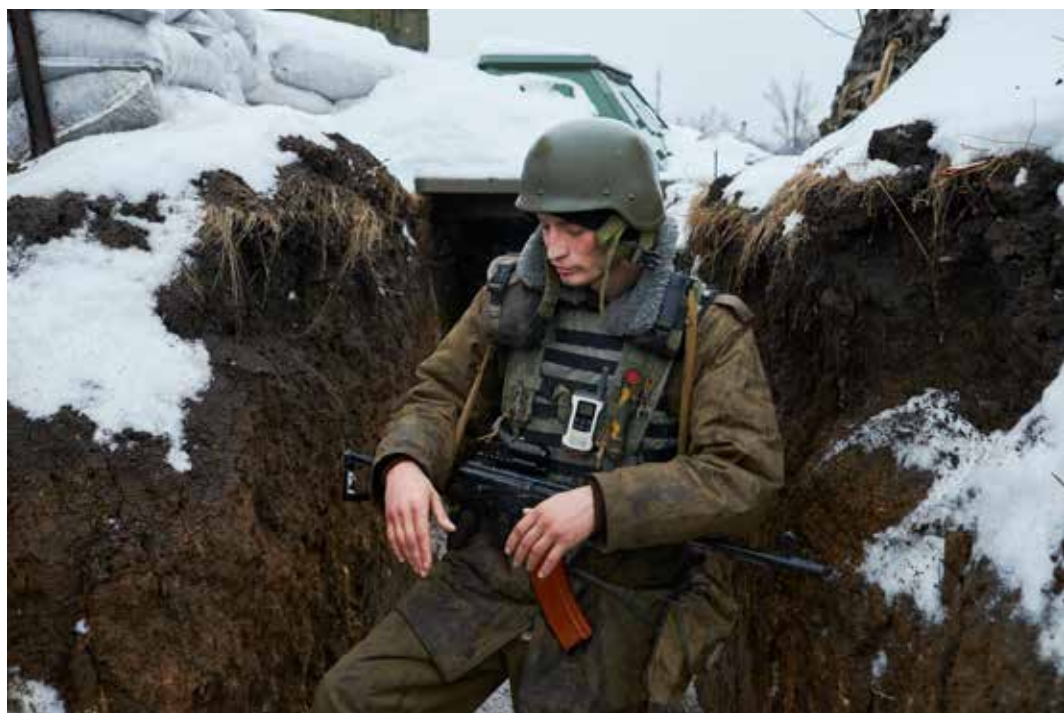
Avdiivka, January 08, 2016 - A Ukrainian serviceman stands guard in a trench on the frontline.