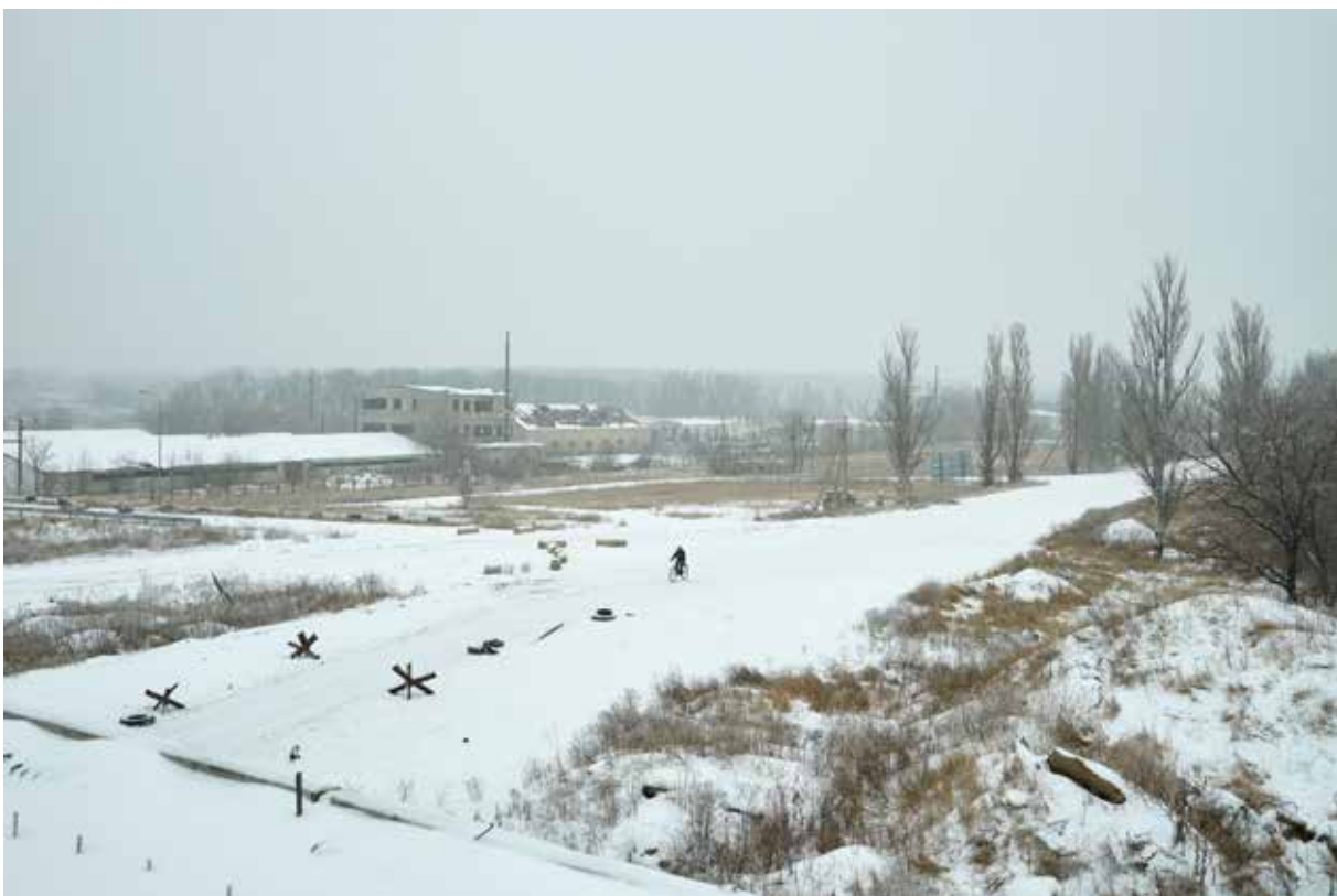
Pisky, January 07, 2016 - A resident rides his bicycle through a Ukrainian roadblock on the frontline.