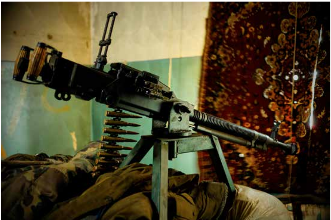
Pisky, January 07, 2016 - A machine gun belonging to Ukrainian forces is ready to target Russian-backed separatists on the frontline.