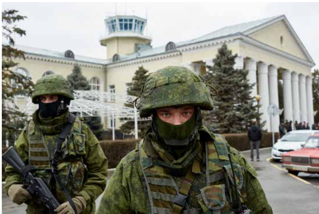
Simferopol, February 28, 2014 - Russian soldiers without insignia take control of the international airport.