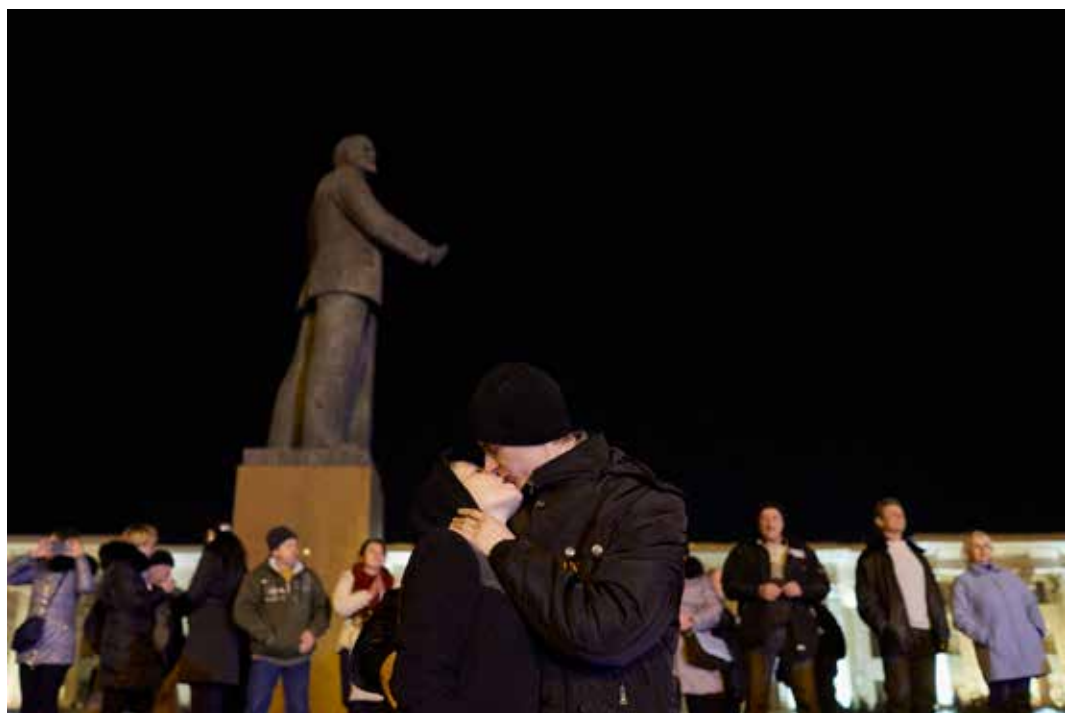
Simferopol, March 02, 2014 - A couple kiss on Lenin square.