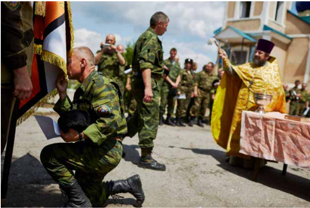
Pervomaisk, July 11, 2015 - Russian-backed Cossacks attend a swearing-in ceremony for new recruits.