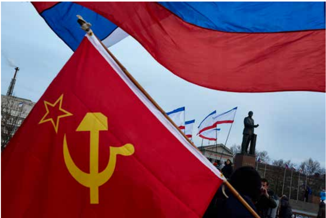
Simferopol, March 16, 2014 - Voters wave flags on Lenin square during the referendum.