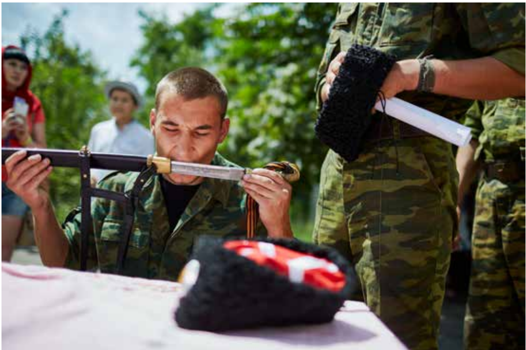
Pervomaisk, July 11, 2015 - A new recruit kisses a Cossack sword.