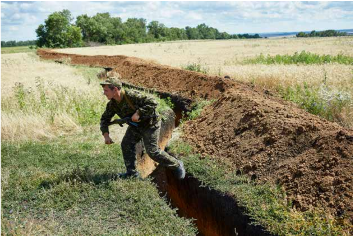
Zholobok, July 12, 2015 - A member of the pro-Russian Prizrak (Ghost) brigade climbs out of a trench on the frontline.