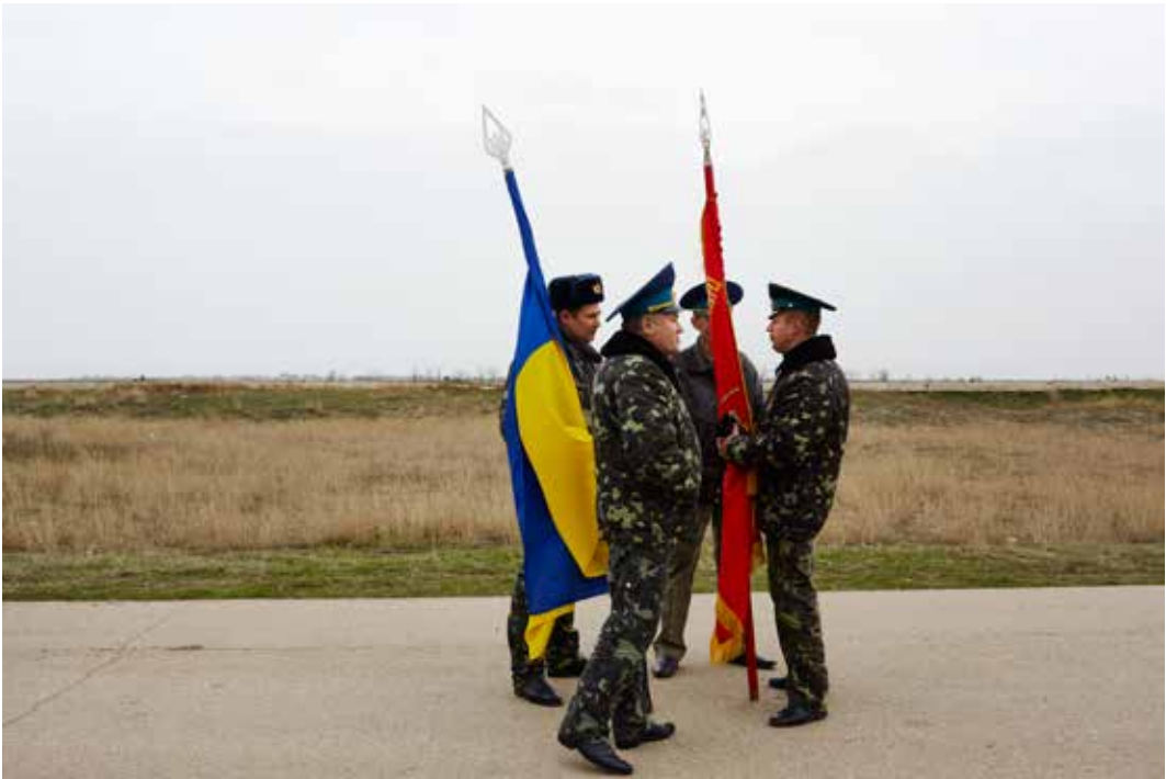
Lubimovka, Belbek military base, March 04, 2014 - Ukrainian officers await the end of negotiations after Russian forces took control of the military airbase.