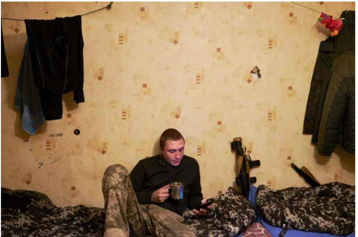
Avdiivka, January 08, 2015, A Ukrainian serviceman rests in an abandoned residential building on the frontline.