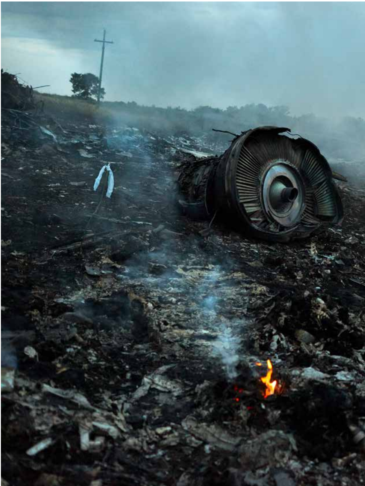
Grabovo, July 17, 2014 - Flight MH17, traveling from Amsterdam to Kuala Lumpur, was shot down by a surface-to-air missile from an area under control of Russian-backed separatists. None of the 298 passengers and crew members survived.