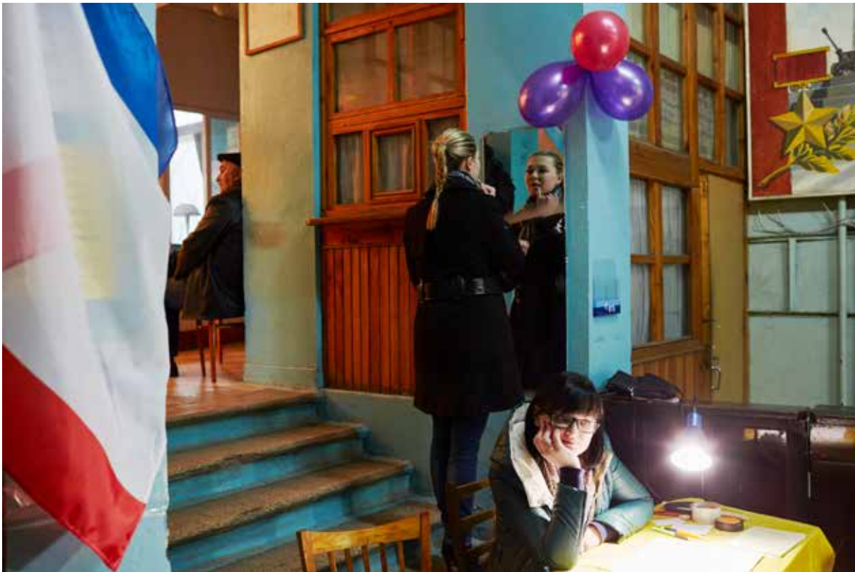
Simferopol, March 16, 2014 - Poll workers wait for voters.