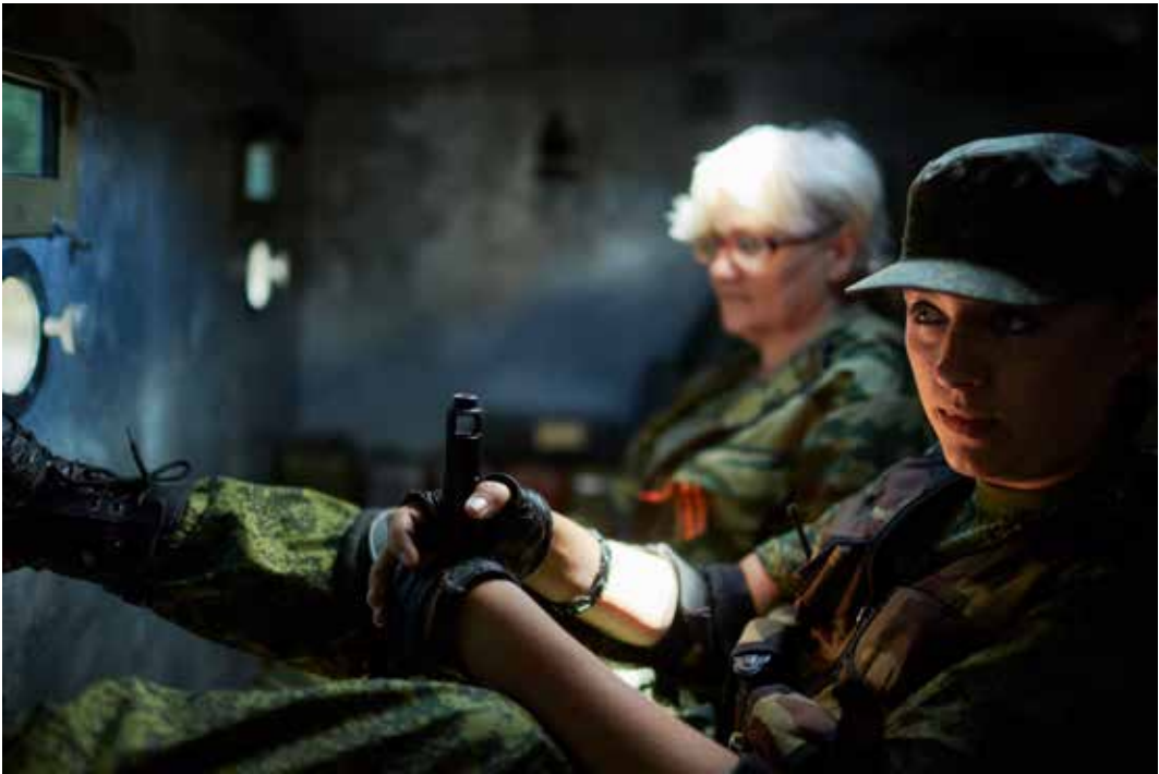
Zholobok, July 12, 2015 - Members of the Russian-backed Prizrak (Ghost) brigade travel to the frontline in an armored vehicle.