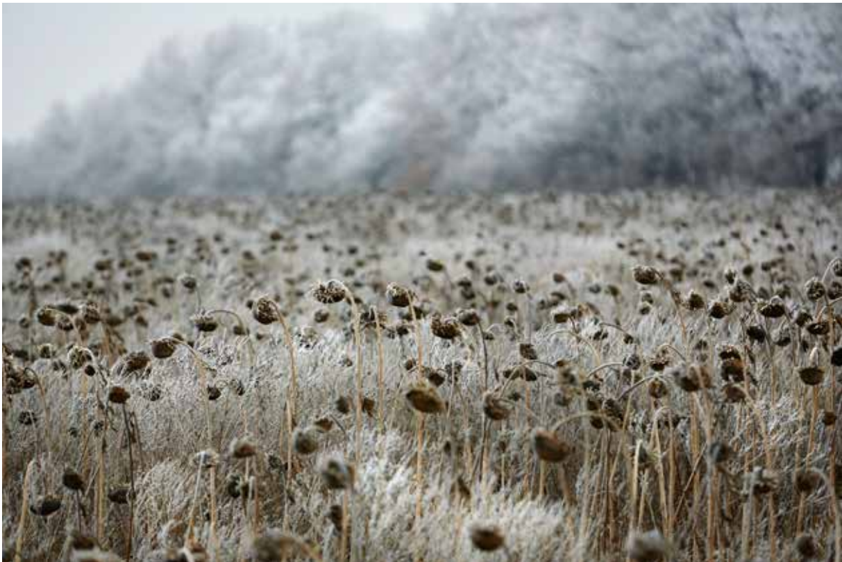
Grabovo, November 11, 2014 - Frozen sunflowers remain unharvested at the crash site.