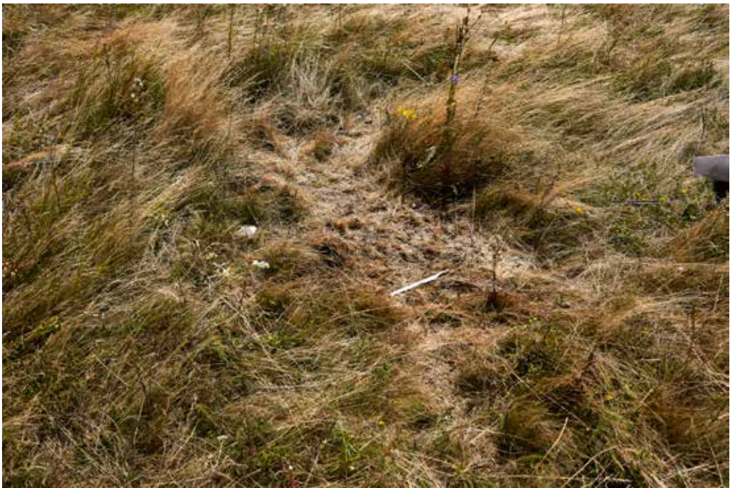
Grabovo, July 30, 2014 - Imprint left on the grass after remains of a victim were recovered.