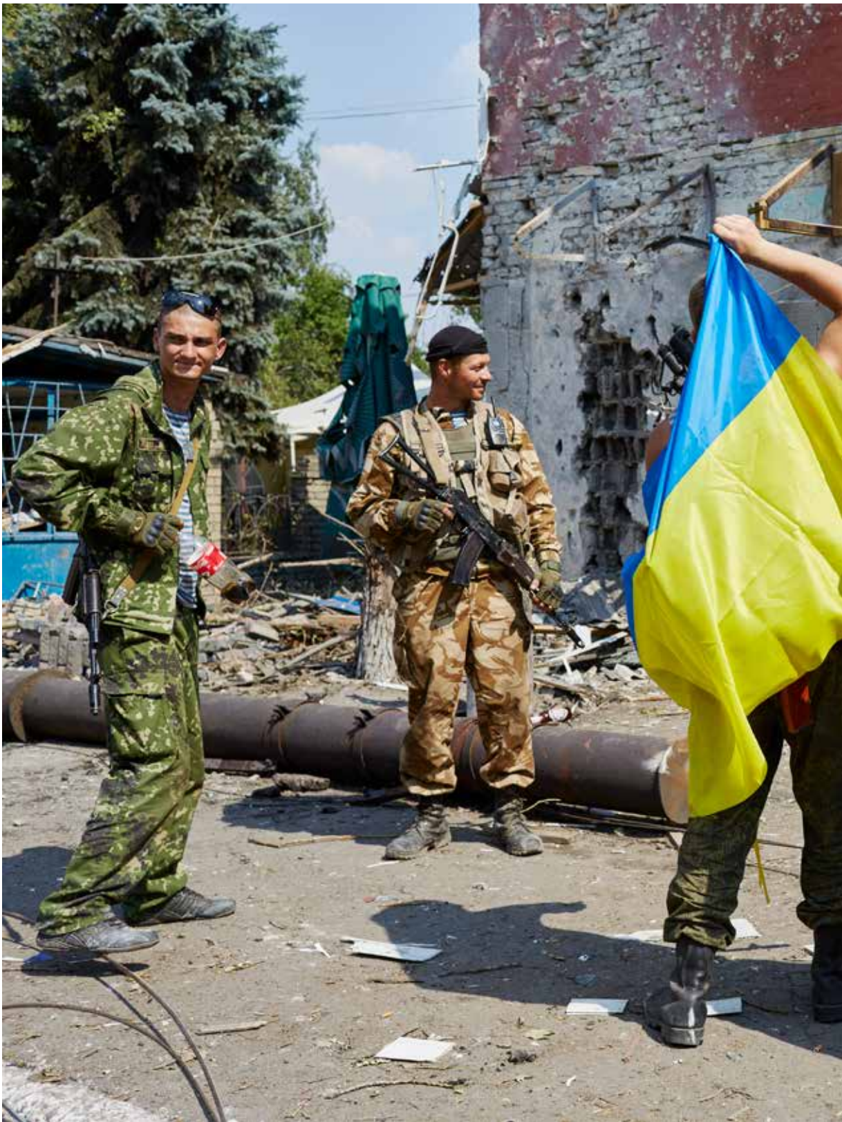
Uglegorsk, August 13, 2014 - Ukrainian forces regain control of Uglegorsk.