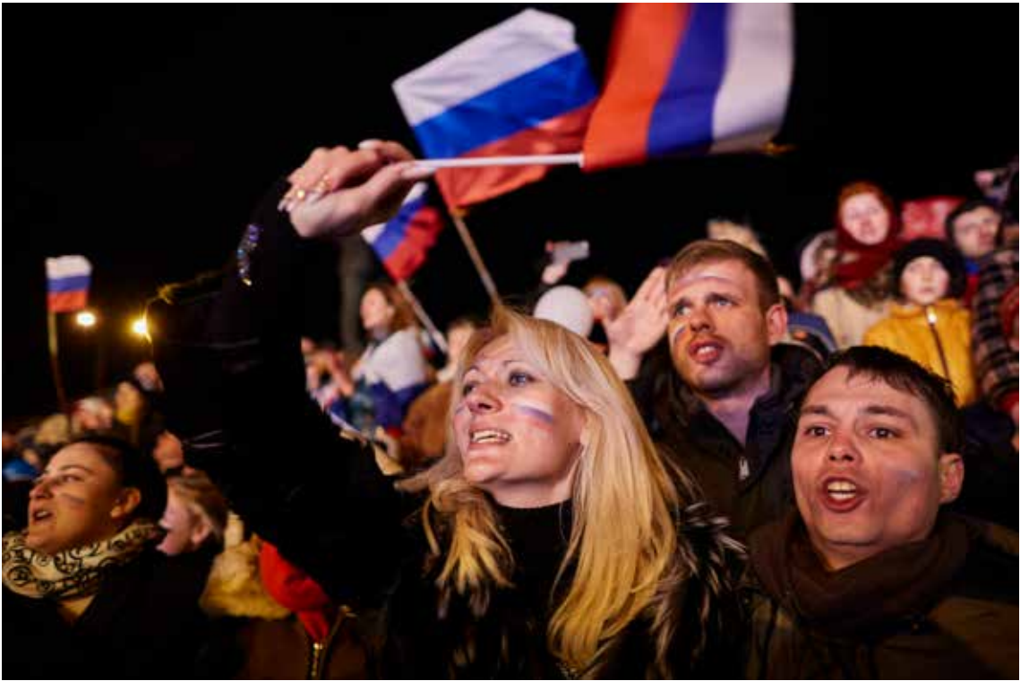
Simferopol, March 16, 2014 - Pro-Russians celebrate the results of the referendum.