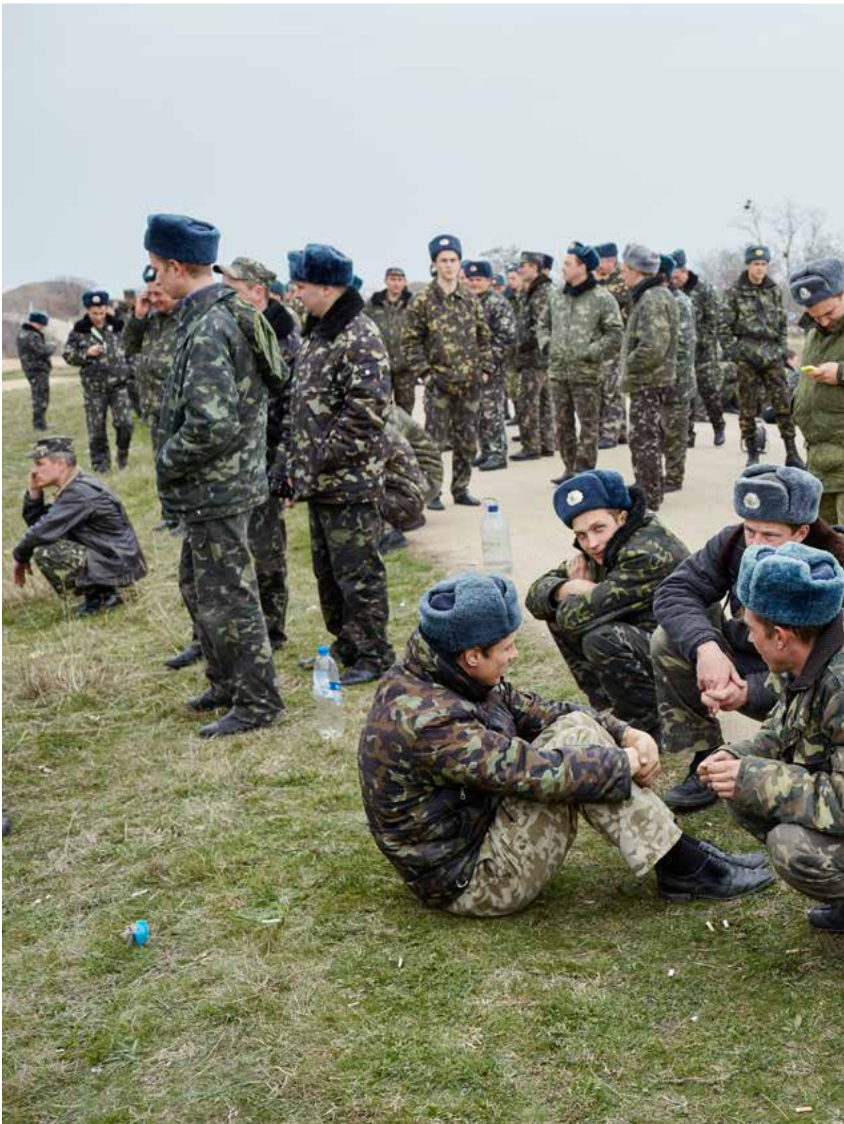
Lubimovka, March 04, 2014 - Unarmed Ukrainian soldiers await the end of negotiations on their seized airbase.