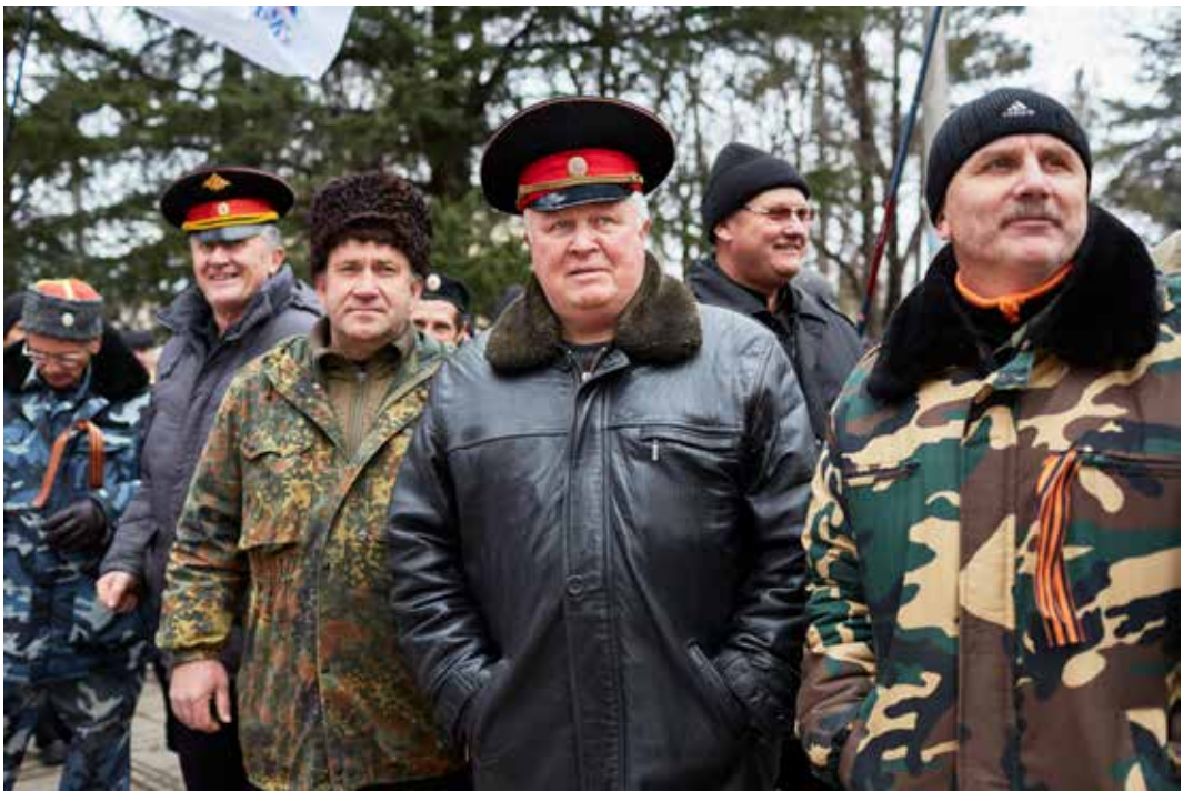
Simferopol, February 28, 2014 - Pro-Russian militias gather outside the Regional Parliament.