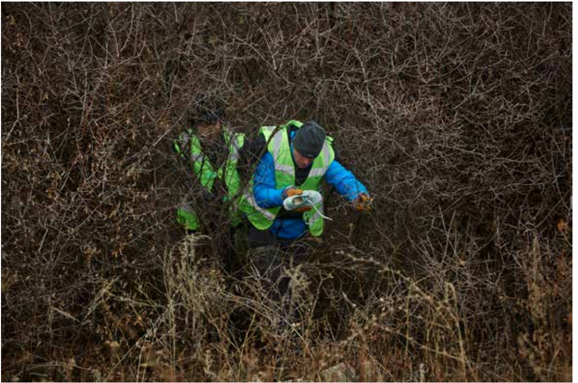
Grabovo, November, 18 2014 - Dutch forensic experts recover a shoe believed to have belonged to a MH17 victim.