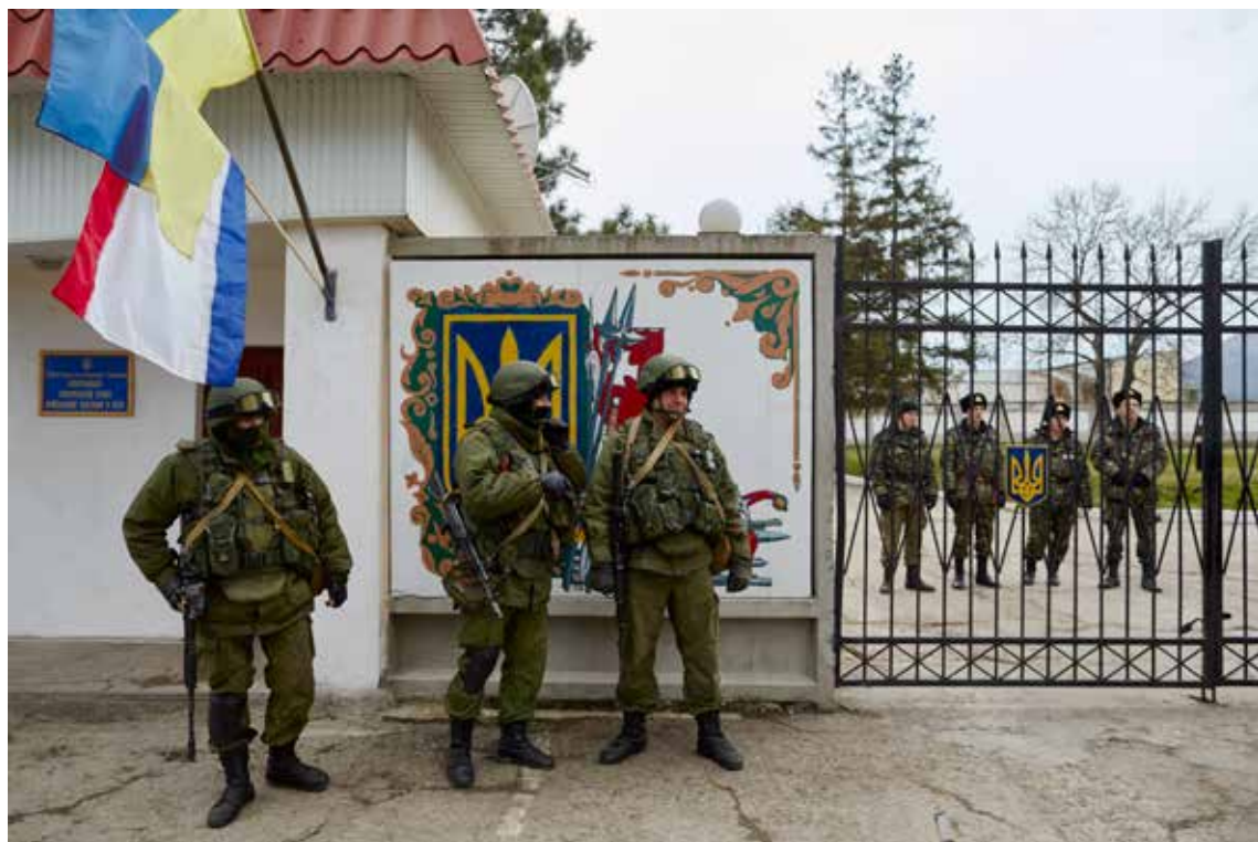
Perevalne, March 02, 2014 - Russian forces without insignia surround a Ukrainian military base.