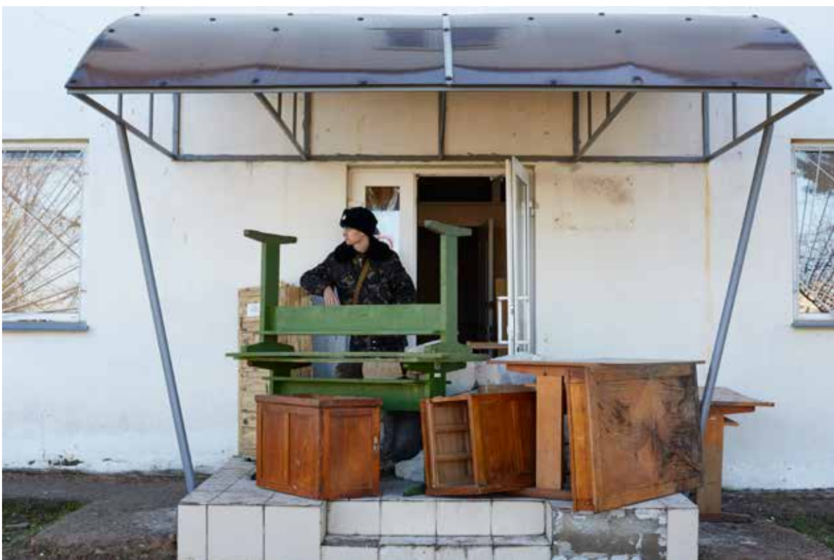
Lubimovka, March 05, 2014 - A Ukrainian soldier stands guard inside a military base as Russian forces take control of Crimea.