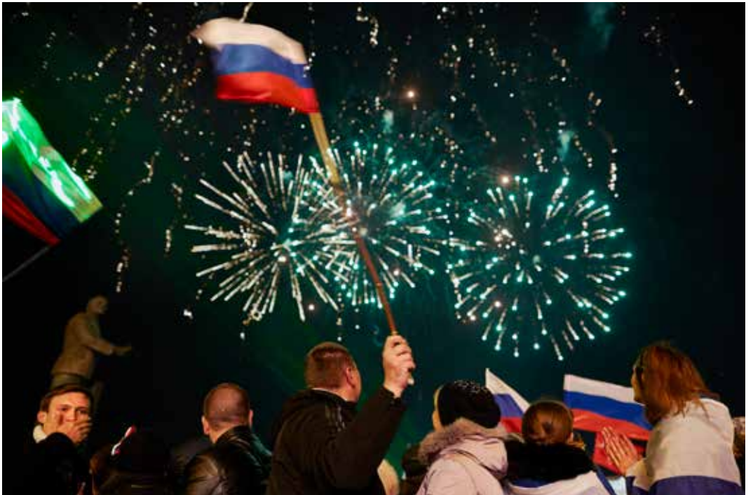
Simferopol, March 16, 2014 - Fireworks light up Lenin square during the referendum's celebrations.