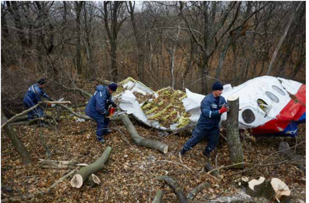
Grabovo, November 18, 2014 - Workers recover a large part of the MH17 fuselage.