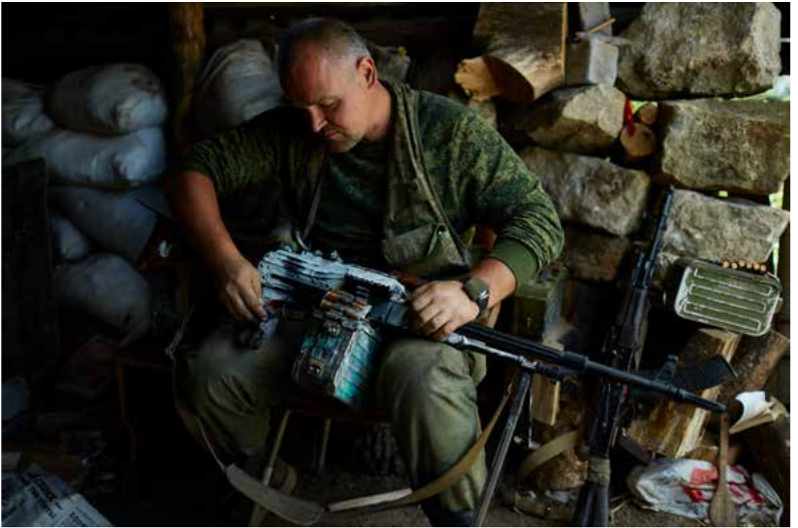
Zholobok, July 12, 2015 - A Russian-backed separatist cleans his weapon on the frontline.